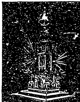
Light from all quarters.