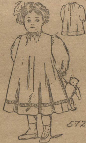
5725.—CHILD'S PLAIN FROCK.

Where more than one pattern is wanted, additional coupons may be readily made after the model below on a separate slip of paper, and attached to the proper illustration.