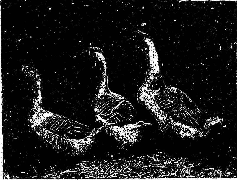
Pure African Geese (adults),

Raised at the Rhode Island Agricultural Experiment Station. Mr. Cushman says that a number of the most extensive and progressive geese-raisers of Rhode Island prefer African Geese to either Embdens or Toulouse, claiming that they are more profitable, that they lay a larger number of eggs, and that their goslings grow faster.