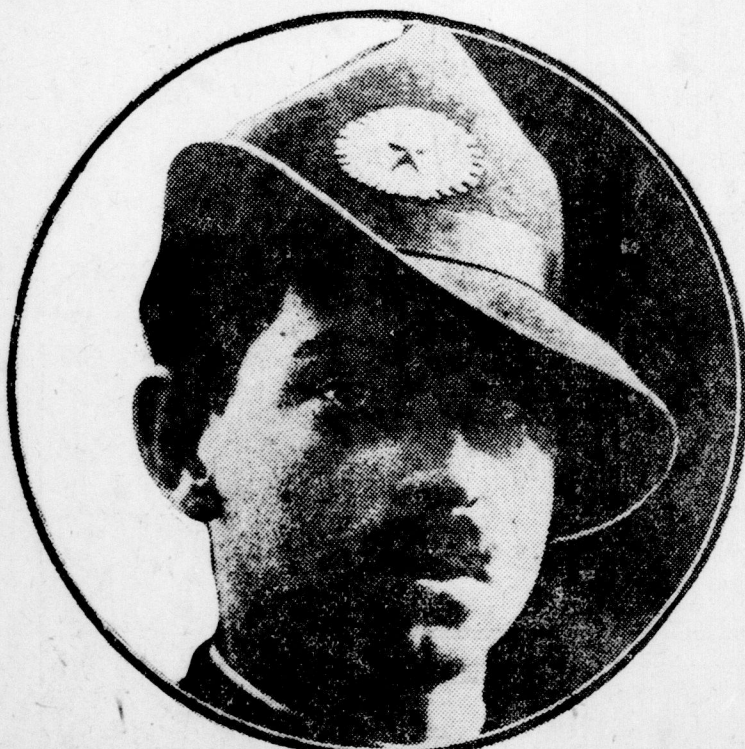
Prince Nicholas of Rumania (above), is very much in love with Princess Mafalda of Italy, whom he is unable to marry, because King Victor Emmanuel, her father, desires her to marry the crown prince of Belgium