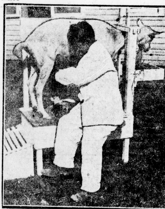
Fearing the entry into the country of the foot and mouth disease, all imports of goats were stopped, so the U.S. department of agriculture has taken up the task of breeding them