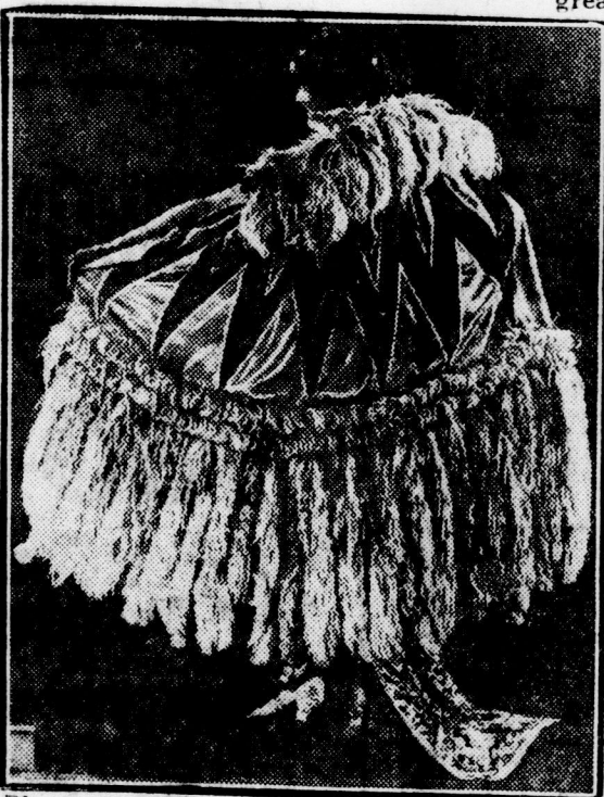
Photograph shows one of the ostrich feather cloaks, fashioned of the finest feathers, which was sent from British South Africa, by the high commissioner, for the British Empire Exhibition to be held at Wembley