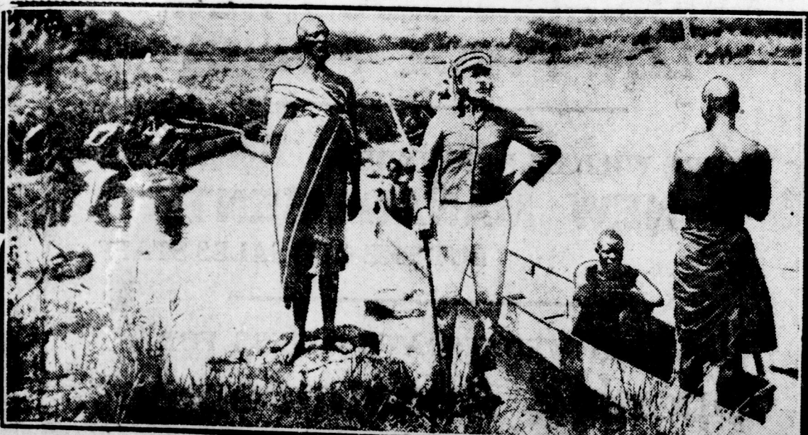
Photograph shows Livingstone's first view of the Zambesi, from one of the scenes in a new motion picture play of the noted explorer's trip across Africa, the exterior of which were made at the locale