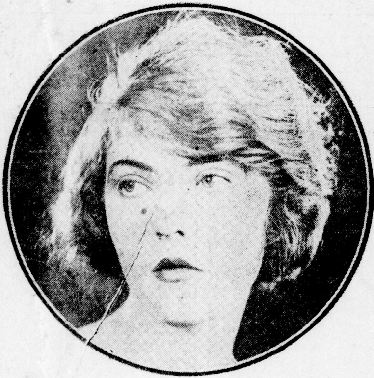
Miss Dorothy Mackaill, of screen fame, has recently become engaged to George O'Brien, son of San Francisco's police chief