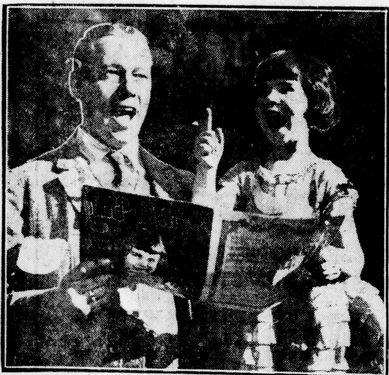
Reginald Werrenrath, world-famous baritone, is pictured staging a duet with Baby Peggy, girl star of movieland. The popular duo are singing a song recently dedicated to the child actress