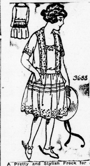
A Pretty and Stylish Frock for a Young Girl.

Pattern 3683 shown in this model. It is cut in four sizes, 6, 8, 10 and 12 years. A 10-year size will require 3 1/2 yards of 38-inch material.