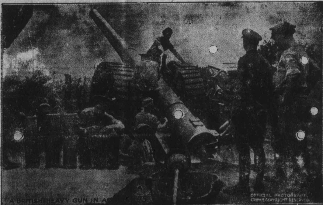
From the Official Moving Pictures of the Battle of the Somme, to be shown at Nickel Theatre Dec. 21 and 22