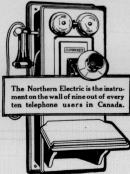
The Northern Electric is the instrument on the wall of nine out of every ten telephone users in Canada.