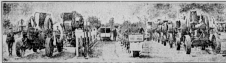
View of Our Exhibit at Brandon Exhibition, 1910

ALL THE LATEST GAS ENGINES FOR SAVING LABOR