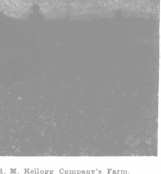
Plowing Under Cow Peas on R. M. Kellogg Company's Farm.

"We have," he says, "in Manitoba an organization called the Grain-growers' Grain Co., Ltd., Winnipeg, c o mposed altogether of grain-growers, the underlying principle of which is cooperation in the disposal of our produce. They have now upwards of 2,000 shareholders, distributed all over Manitoba and Saskatchewan, all of them leading men in the district in which they reside., It would be safe to say that those shareholders produced eight or ten million bushels of grain this year, though and not being able to speak officially (not