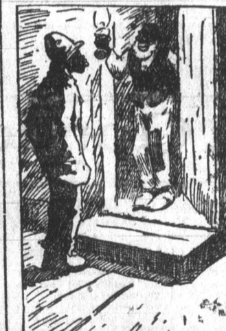
"PICKLES SMITH CUM OBER TO BORRY A DOLLAR."

"Once upon a time in dis kentry we had men who couldn't be bought an'