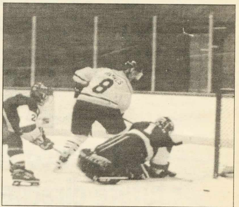
ROAR INTO THE SILENCE: Tiger action before elimination.