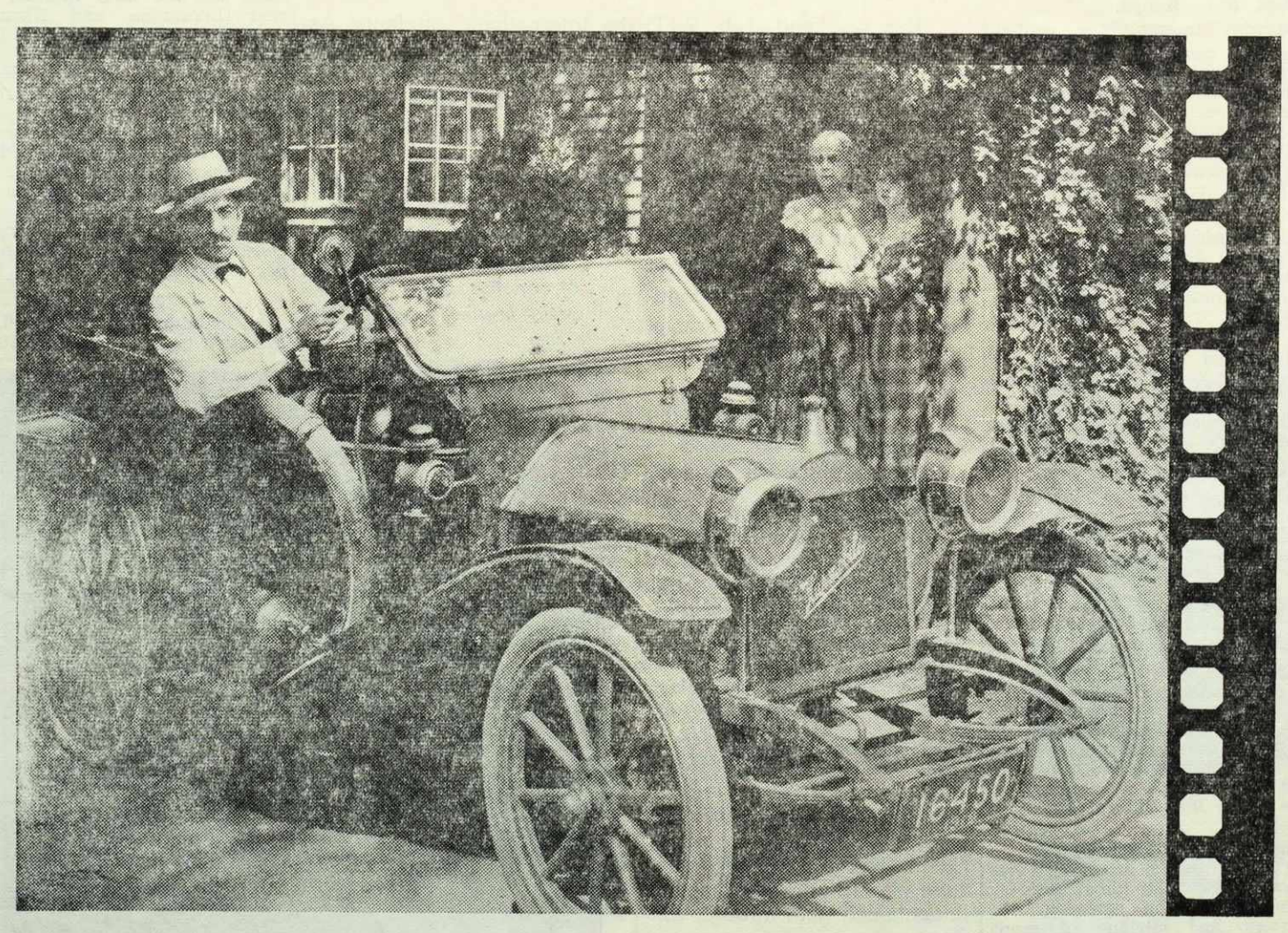
"If he makes it there by six o'clock, I'll eat my bustle!"

But getting there fast is no problem at all, by TCA. Economical, too.