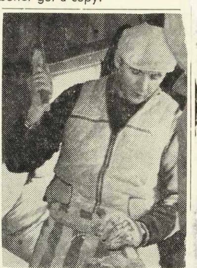
Building Auntie's FOP