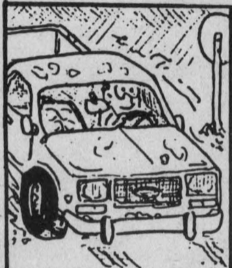
CHRISTMAS HOLIDAYS 1990