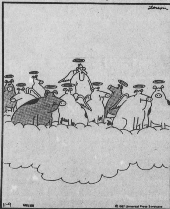
Through some unfortunate celestial error, Ernie is sent to Hog Heaven.