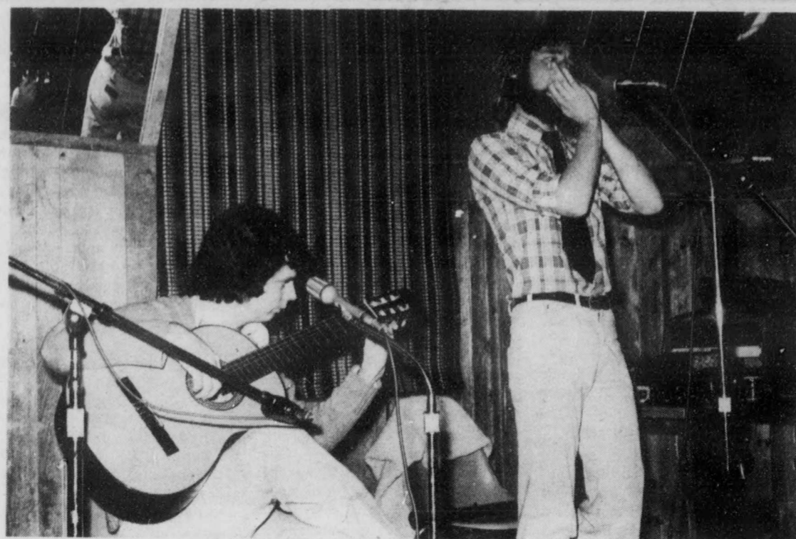
JUDY KAVANAGH Photo