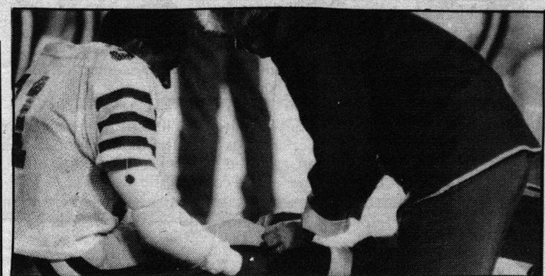
Getaway photographers caught a couple of Bears faking injuries around campus lately. But there is one Bear that is looking forward to the matchup. 'The Beer Cooler' is the U of A's answer to 'The Refrigerator'.