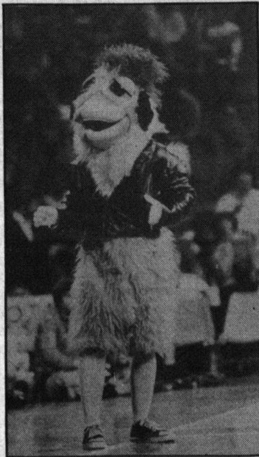
Win Two Free Tickets to See The Chicken: Tuesday November 6/1984 at 7:30 pm the Golden Bear Basketball Team opens their home season against the Lewis-Clark State Warriors and The Chicken will be there. See Thursdays Gateway for contest details!!!