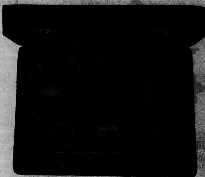
40811. Fine Sterling Silver Toilet Set, Chrysanthemum pattern, in handsome leather-covered case-lined presentation case. Set includes: mirror, hair brush, cloth brush and comb.