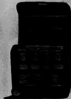
70108. Fine Morocco Leather Travelling Medicine Case, $5.00. Contents: 4 bottles, 3 jars, scissors, small glass jar, pocket for prescriptions and small drawer for miscellaneous articles. Size 4 1/2 x 3 1/2 inches.