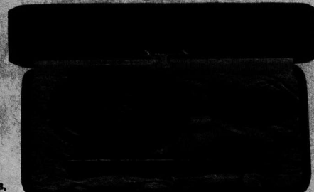
40883. Lady's Ebony Toilet Set, in leather-covered case, $5.00.