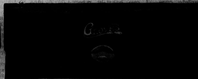
70107. Saphian Leather Glove Case, all-lined, lettering in Sterling Silver, $2.00.