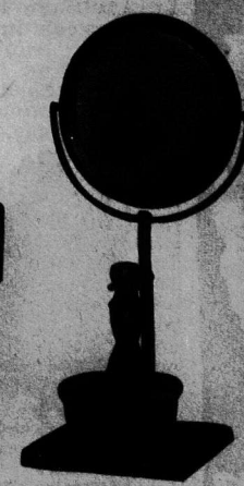
40904. Nickel Shaving Stand, polished hardwood base, $4.25; with shaving brush and porcelain water basin, mirror on one side only, diameter 5 inches.