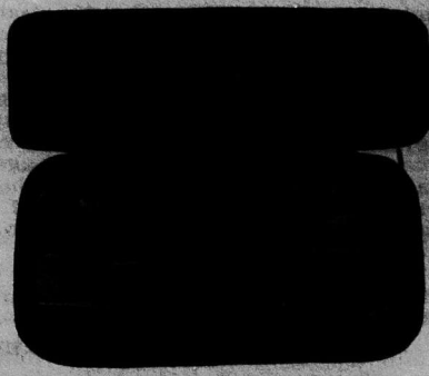
40921. Sterling Silver Writing Set, etched pattern. Contents: ink bottle, pen handle, letter opener and eraser.