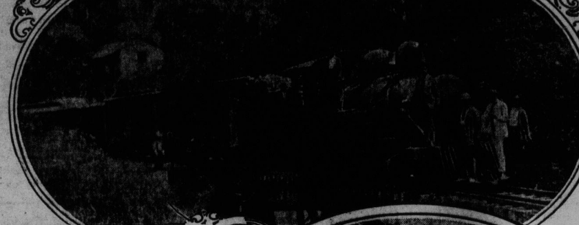
TRAIN ON THE COLOMBIAN NATIONAL RAILWAY

For its progress and material development Colombia's first and greatest need, according to its men of broad vision, is railroad communication between Bogota, the capital of the republic, and the ports on the Caribbean Sea and the Pacific Ocean. Under the most favorable conditions today the journey from Barranquilla, on the Magdalena River near the Caribbean, to Bogota consumes about ten days. Two Magdalena River boats and three railroads have to be used in making the trip. For the Buenaventura port on the Pacific even a longer time is required. Much of the way is covered on muleback or horseback. It is admitted by the statesmen and economists of Colombia that a railroad line which would enable the carrying of passengers and freight from Bogota to Barranquilla or Santa Marta in thirty-six to forty-eight hours would revolutionize the life and trade of the nation.