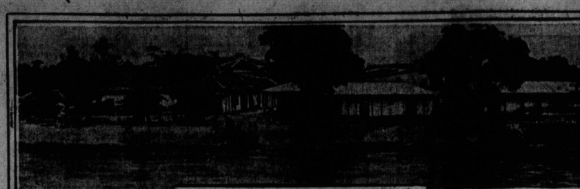
ALONG THE MAGDALENA RIVER ROUTE