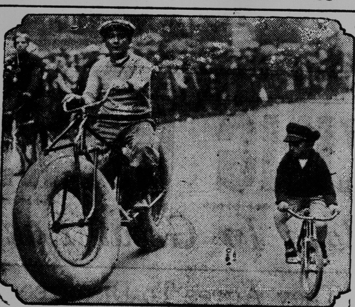
A balloon-tire equipped bicycle and its baby brother appeared on the New York streets recently causing folks to inquire, "What next?"