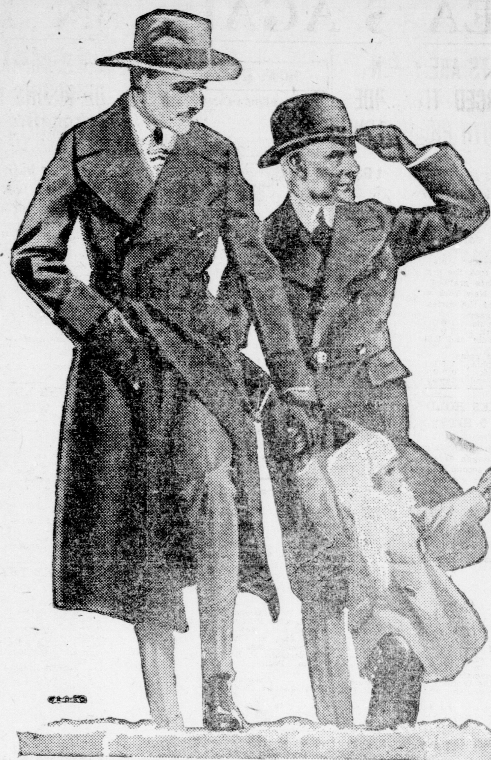
Society Brand Clothes

BOYS' UNTEARABLE STOCKINGS —1-1 Rib, all sizes, 3 pairs for $1.00. BOYS' 2-1 RIB STOCKINGS, SPECIAL 29c. BOYS' SCHOOL CAPS. BOYS' SCHOOL BLOUSES. BOYS' FALL AND WINTER UNDERWEAR.