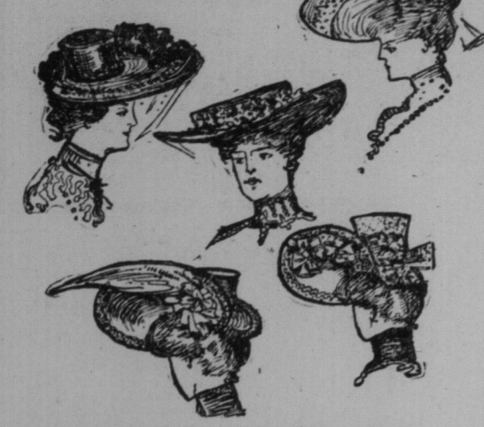
This sketch was made by our purchasing representative in New York for our information. We publish it merely to show how closely we keep in touch with the metropolis.

We've opened a new department in connection with our establishment, a New York and Paris Ladies' Hat Department. The stock was all selected by our own representatives in those big cities—and outside of our store you cannot find their equal in Canada.