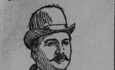
EUGENE REBER, Mayor of Port Colborne.

Continued From Page 1. generated at Niagara, it is no secret that any plant utilizing this force will be able to produce steel at a cost of from 15 to 25 per cent. cheaper than at other plants in Canada, where the old methods are in vogue.