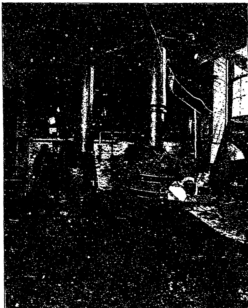
FIG. 4.—STILL ROOM AND APPARATUS.

herewith were prepared by the American Lumberman.