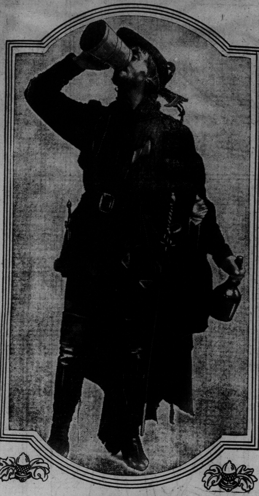
E. M. SOTHERN AT THE ALEXANDRA