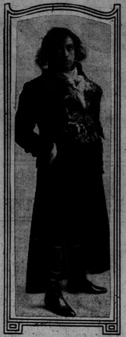
MARTIN HARVEY AT THE PRINCESS