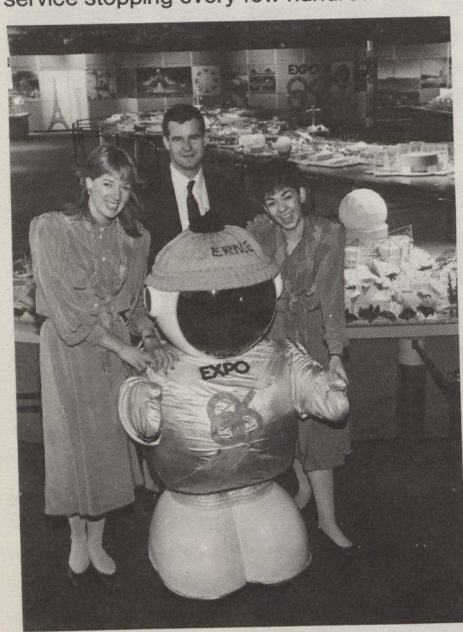
Expo Ernie and guides invite visitors to preview tours at the Expo Display Centre.

The False Creek site is connected endto-end by a 5.5-kilometre monorail system, elevated five metres above the ground and offering its passengers a panoramic view of the exposition, and by an intra-site ferry service stopping every few hundred metres