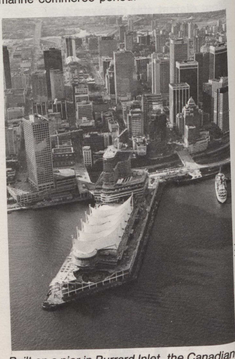
Built on a pier in Burrard Inlet, the Canadian pavilion, Canada Place, will house a cruise ship terminal, a luxury hotel and world trade centre and a BD IMAX theatre.

Special events will also be held, like the twenty-fifth anniversary celebrations of the Abbotsford International Airshow during the aviation period or the meeting of as many as 50 of the world's Tall Ships during the marine commerce period.