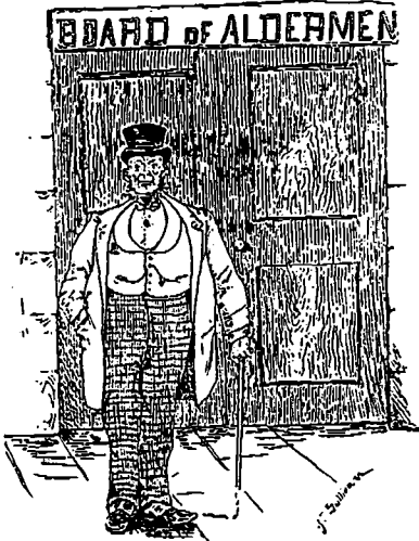
TEN YEARS AFTER.

McCull's Lardine Machine Oil. It does not gum or clog machinery, and wears equal to Castor Oil. THEIR RENOWNED CYLINDER OIL Guaranteed to do better and cheaper than tallow. Try above Oils and you will buy no other. Made only by MCCOLL BROS & CO. - TORONTO