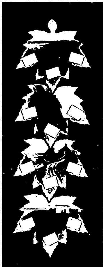
Pretty Calendar Illustrating Canadian Scenes—Copp, Clark Co.

ed this Fall under the name of Stage. Its cards bear the portraits of all the leading actors and actresses, and, even apart from the game itself, the cards possess an interest of their own.