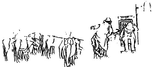
11. But he could learn no tidings of him