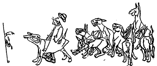
14.—But his wife, giving him the hint, he found his beast again, and that the ass he rode upon was forgot in the reckoning.