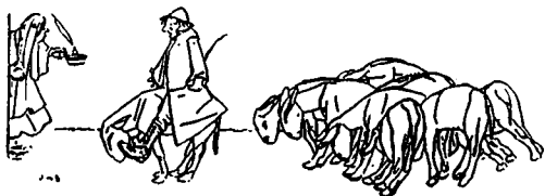
13. The loss went to the heart of him;