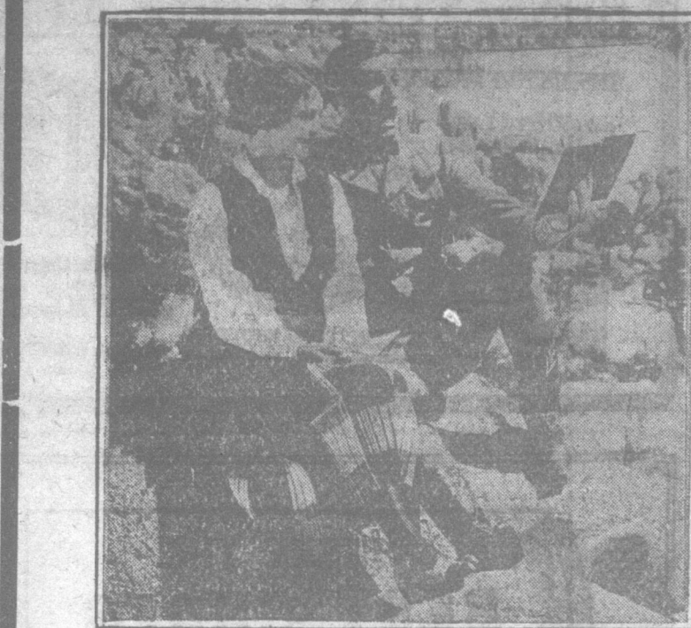
TOM MIX AND BARBARA BEDFORD IN ROMANCE LAND

LONDON, March 12. The Canadian Press learns that an adjustment of accounts has been reached between Great Britain and Canada with regard to war liabilities, and that the amount Canada is to receive in settlement is between eight and ten million dollars. Payment will become operative on April 1st. More than a year ago Canada put in a claim for nearly thirty-three million dollars as the balance due the Dominion from Great Britain in ad-