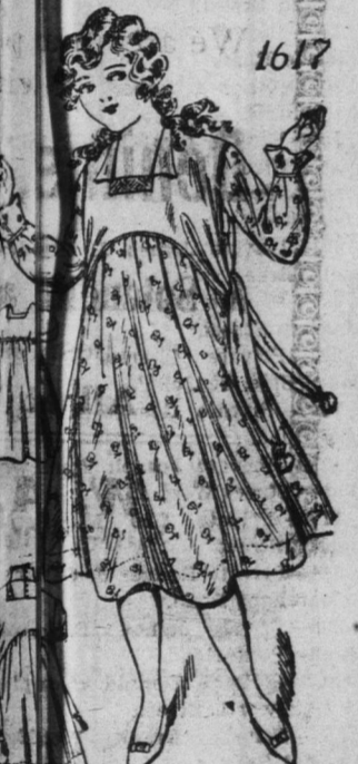
ANKLE ROCK FOR THE GROW- ING GIRL.

Junior Dress in High or Low Empire Style, with or without sleeves, and with Two Styles of Sleeve. Front shawl, with a pink floral band. The pink fabric for bolero, is combined. The model is nice in batiste, lawn, crepe, tulle, silk, or, and a velvet, net or chiffon. Empire waist is especially pleas- ing and girlish. The dress will be easy to dance or party wear. The skirt is new and attractive, and is made of embroidery or satin ribbon.