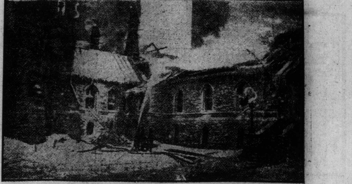
Firemen playing hose on the wing leading to the Library which was eventually saved.

A hat made of fifty new $1 bills was worn by a girl of Columbus, Ind.