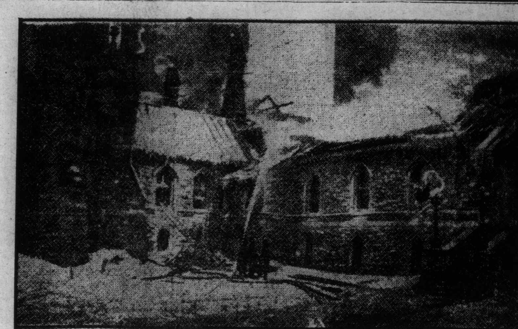
Firemen playing hose on the wing leading to the Library which was eventually saved.