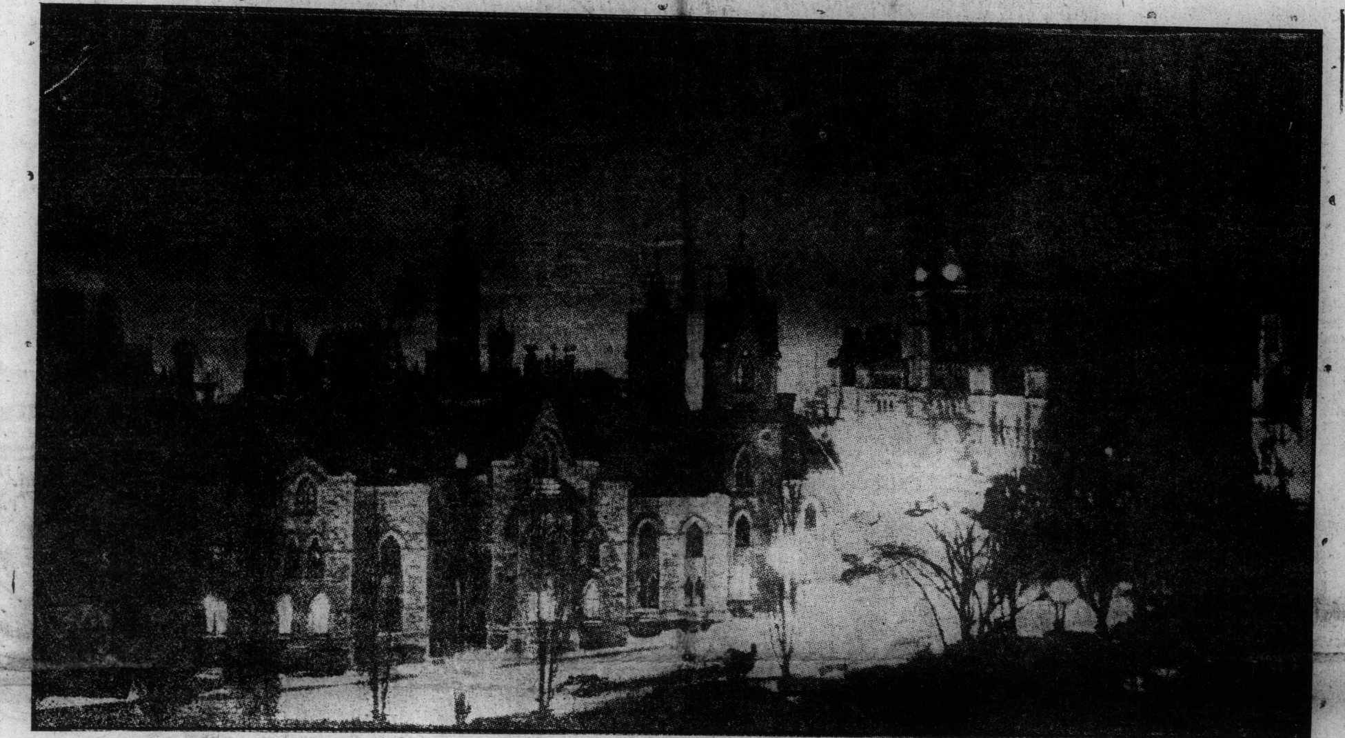
This photograph was taken at 10 o'clock on Thursday night, while the fire was burning fiercely, and several ho urs before the clock tower collapsed. The reflection of the flames can easily be seen, and the nearby buildings were illuminated by the light of the fire.

justice yesterday said there was, no correspondence in the department to substantiate Editor Rathom's assert-