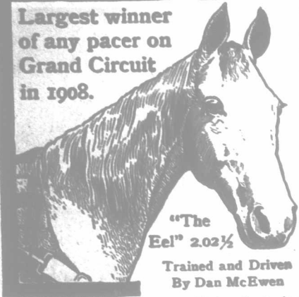
"The Eel" 2.02 1/2

Largest winner of any pacer on Grand Circuit in 1908.