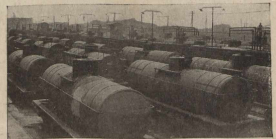
“Imperial Asphalts can be quickly delivered to any part of the Dominion. They come in tank cars or packages, whichever is best suited to your requirements.”

“There are three Imperial Asphalts for road purposes, Imperial Paving Asphalt for preparing Hot-Mix Asphalt (Sheet Asphalt, Bitulithic, Warrenite, or Asphaltic Concrete), Imperial Asphalt Binders for Penetration Asphalt Macadam and Imperial Liquid Asphalts for dust prevention and for increasing the traffic-carrying capacity of earth, gravel and macadam roads.”