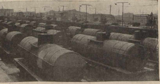
"Imperial Asphalts can be quickly delivered to any part of the Dominion. They come in tank cars or packages, whichever is best suited to your requirements."

"During the war our whole energies were devoted to peace with victory. Labor and materials alike were diverted to essential war work."