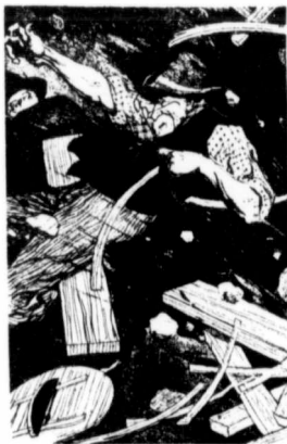
Simultaneously with the report, the atmos- phere was filled with dust and ashes, pieces of brick and flying planks.

"I never heard about it," he said. "No," the aged terror responded, proudly; "and a good reason, too. They was that flab-basted and bottled up that they couldn't abear to speak of it after- wards. The way I done was this. When Jerry was a boy, me and him was up in the forest cutting wood for the engine at the mill, and last thing every day we used to stack wot we cut, and measure it. Well, one morning when we got there I seen the tracks of cart-wheels on the ground, and about a ton of our wood was gone. Same thing happened a few nights later, and kept going on till I got sick and tired of it. So, one night as soon as tea was over, I loaded up my Winchester repeater, and went back as fast as I could to where we'd been cutting that day, and climbed