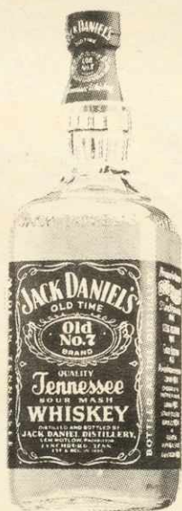
JACK DANIEL'S TENNESSEE WHISKEY

If it rolls to a stop with the bung down, it'll leak whiskey by the gallon. But our barrelman knows how many turns and partial turns each barrel will make as he fills up a rick. So he'll turn the bung to just the right position before he kicks a barrel. And it'll stop with the bung straight up. After a sip of our Tennessee Whiskey, you'll be glad we didn't spill a drop.