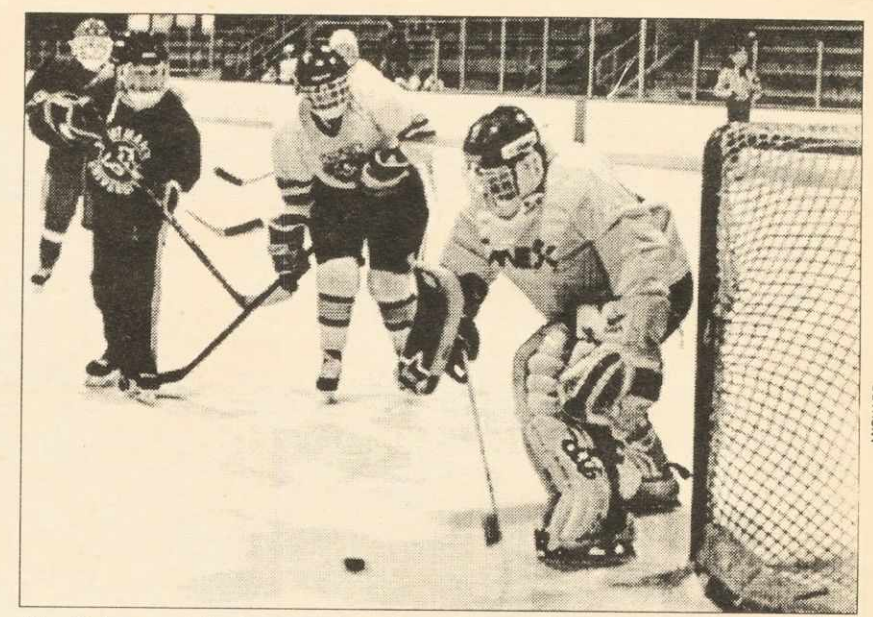
The Dal women's hockey team skated past the Saint Mary's squad 5-1 on Saturday.