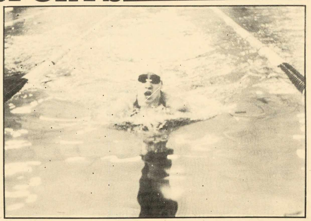
The Dalhousie swimming team made major waves in the AUAA this past weekend by winning a Double Meet at Dalplex.

The Tigers next see action Feb. 15 when they travel to Moncton to compete in an AUAA league tournament.