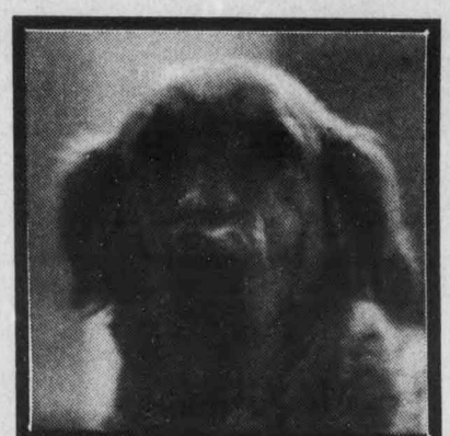
Kandy My Dog "Some balls!!!"