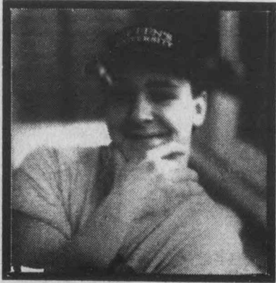
The Bobster GE VI "A shopping spree in Maine"

What would you give Mulronev for Valentines Day?