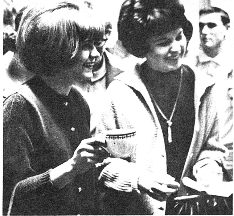
EUS HOT CHOCOLATE PARTY ... all that glitters is not gold key.