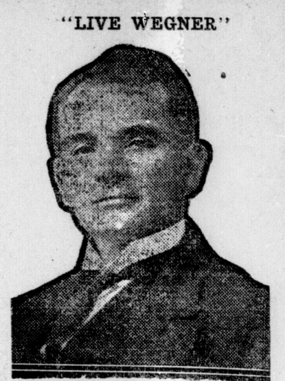
THE CLOTHING KING

$1.19, $1.25 $1.49, $1.95 $2.19, $2.35 Every size up to 52 inches.