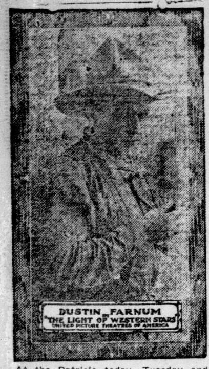
At the Patricia today, Tuesday and Wednesday.

EXTRA! Straw Hats ARE NOW IT. With a capital "I" And we have a great variety in many styles, in both English and domestic makes. English Bancock Hats. $3.00 Boater Straw Hats. Sailor Jap Cord Straws. $1.95