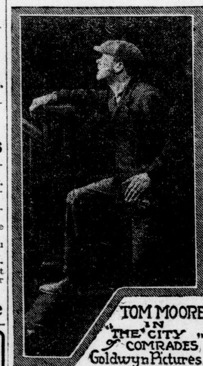
At the Majestic Theatre today, tomorrow and Wednesday. Also a Harold Lloyd comedy.