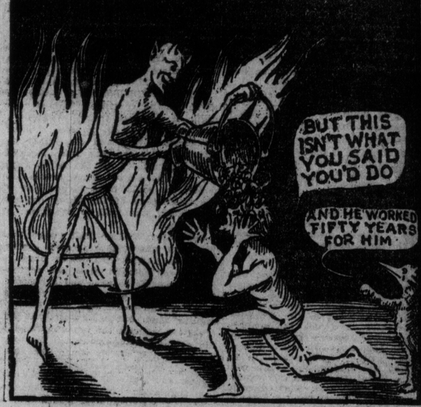
TORONTO WORLD PROVERB PICTURE NO. 30