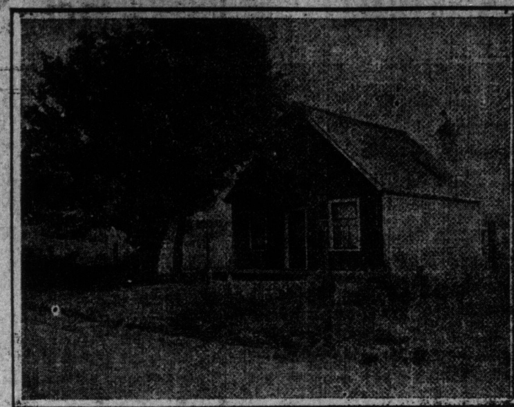
Here is one of the Four-room Cottages we have for sale. Doesn't it look comfortable? You would have to pay only $10 per month for this home, and you would not be paying rent—you would be paying for the cottage.