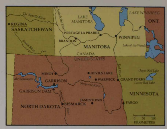
The Missouri River and Hudson Bay watersheds, separated for 10,000 years by a continental divide, have had time to develop distinct flora and fauna, which may be threatened by the planned Garrison Diversion irrigation project in North Dakota

When the prairie glaciers retreated they went downhill into Hudson Bay. Below the border is