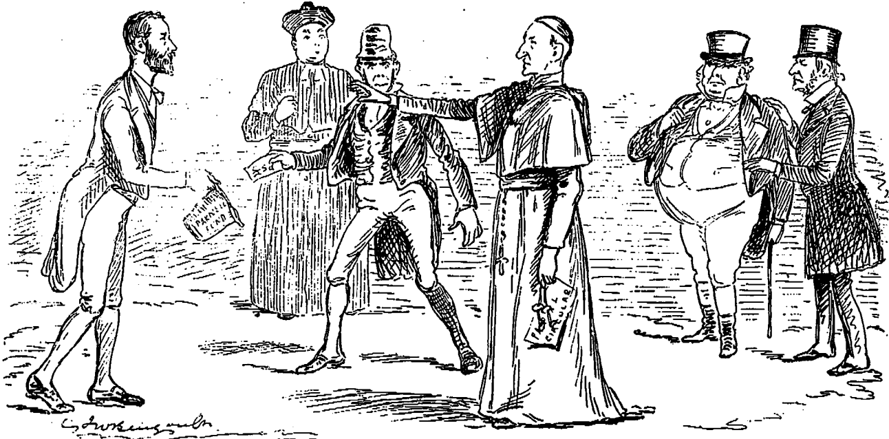
POPE vs. PARNELL; OR, THE IRISHMAN'S DILEMMA.