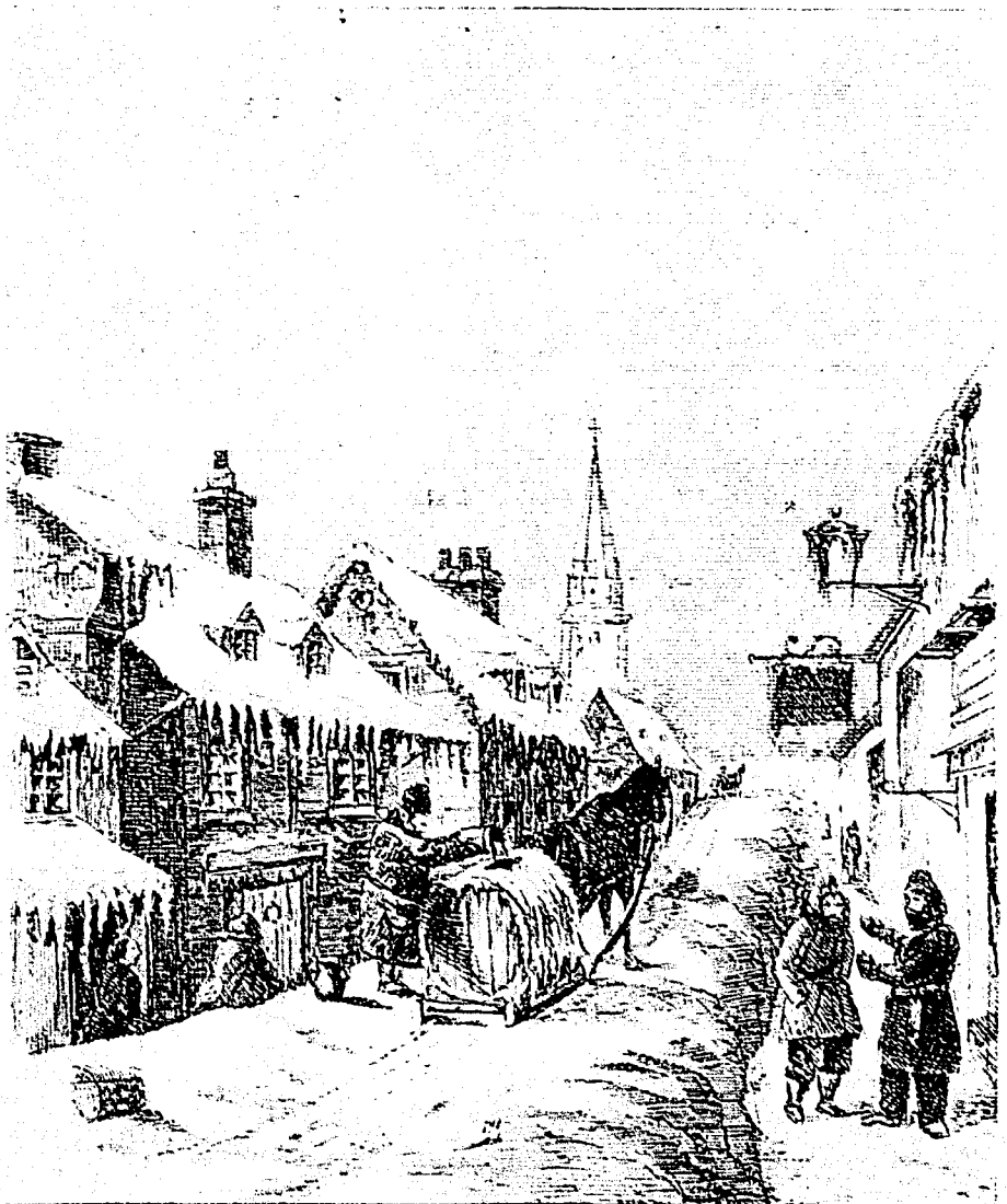
STREET SCENE IN THE SUBURBS OF QUEBEC.—FROM A SKETCH BY W. O. C.