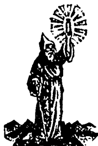
A CURE IN EVERY BOTTLE.