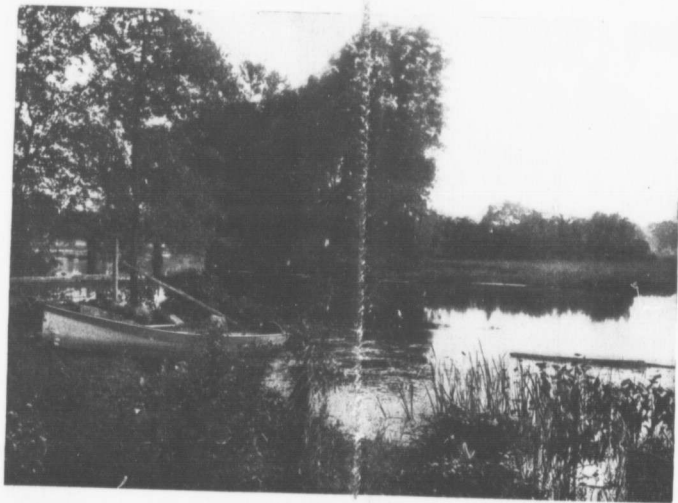
BY STILL WATERS.