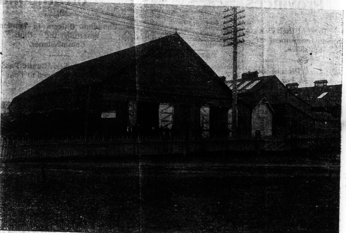
B. C. METALLIC BED CO.'S FACTORY.